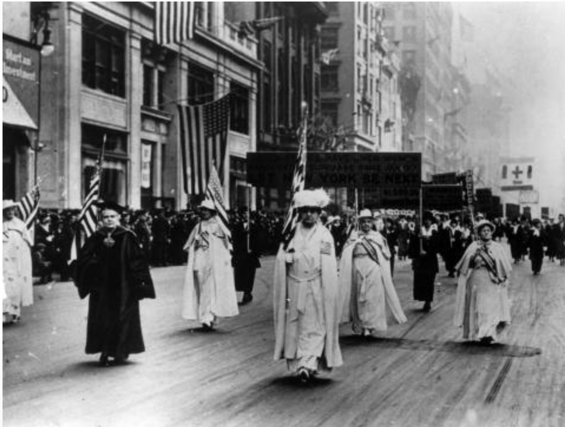
Women Marching for Suffrage in New York City Circa 1917